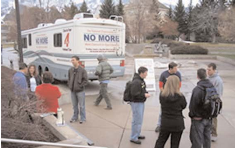
2005–06 National Peer Educator Tour

T wenty colleges and universities make up the 2005 cohort of grantees from the U.S. Department of Education's competition for Grants to Prevent High-Risk Drinking or Violent Behavior Among College Students. Grantees receive funds to develop or enhance, implement, and evaluate campus- and/or community-based prevention and early intervention strategies to prevent high-risk drinking, drug abuse, or violent behavior among college students.